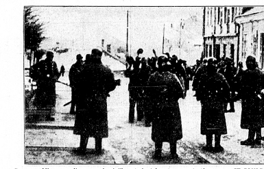
German soldiers rounding up male civilians to be taken to concentration camp. IT COULD BE ANY MANITOBA TOWN.

Zwanzigtausend jüdische... die Carnegie Bibliothek in Winnipeg... und die St. Boniface Kathedrale... wurden niedergebrannt.