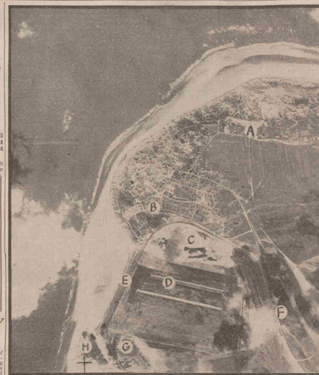
Showing how the Nazis are building aerodromes at their nearest point to Britain.—An R.A.F. picture taken during reconnaissance over Langeneß, one of the Frisian Islands. Key to annotation: A—Ammunition store. B—Barracks. C—Canteen. D—Aerodrome. E—Causeway connecting main island with Filinthen dunes. F—Light railway leading down to new harbour. G—Part of the dune being removed and levelled. H—Filinthen dunes, now connected with main island.

MR McKenna added that the banks could serve the nation in the present struggle by helping to delay, or even avoid, the onset of the bugbear of inflation. The wise course was to prevent or limit inflation by every prudent means of diverting goods and services from civil to military purposes.